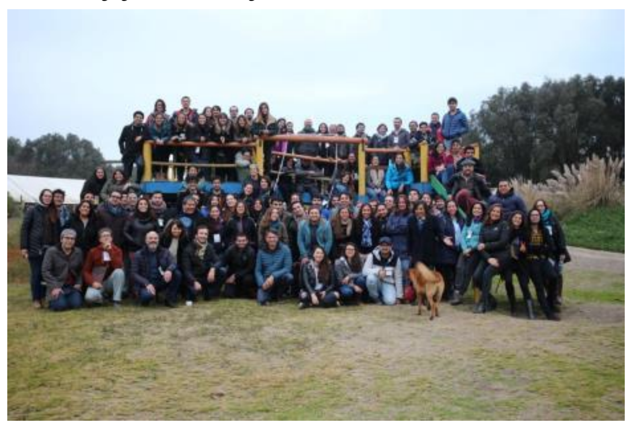
Photograph (above): The BNI team at the annual retreat in Mantagua.

We also encourage the interaction of students with more than one laboratory and mentor, as a manner to enrich the opportunities and cross-fertilizing fields. During 2018, more than 10 theses were co-directed by BNI Investigators. Students are encouraged to share BNI facilities, educational and technology transfer opportunities. Postdocs, graduate, and undergraduate students take the initiative and organize regular seminars and symposium in the framework of BNI, inviting foreign established scientists, or national postdocs carrying out research periods abroad. Investigators, trainees, and staff attended our annual retreat as a means to share the research culture, which fosters a sense of belonging to a school of thought.