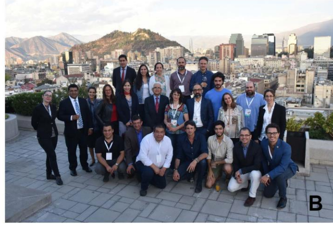
Figure 1. Regular activities done by BNI. A-Sample of topics discussed at Neuromedicne Conversations series, BSample of topics discussed at Pizza talks events, CSample of topics discussed at BNI Transforma series.

As indicated in Networks, during 2018 we carried out another NeuroSur meeting, Frontiers in Neurotechnology: A Latin American perspective (dec 5th, 2018). In this symposium attended 12 international and 5 national speakers, a long with 64 participants. NeuroSur represents a collaborative network strategy between BNI and centers of excellence in Neuroscience in Latin America (Brazil, Argentina, Uruguay and Chile).