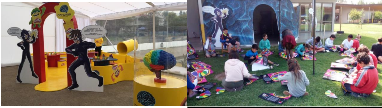
Photographs (above): pre-school kids at the Dendros/Play-Doh stand and the brain-dome.