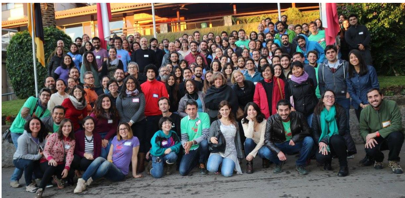
Photograph (above): The BNI team at the annual retreat in Termas del Corazón.

We also encourage the interaction of students with more than one laboratory and mentor, as a manner to enrich the opportunities and cross-fertilizing fields. During 2017, more than 10 theses were co-directed by BNI Investigators. Students are encouraged to share BNI facilities, educational and technology transfer opportunities. Postdocs, graduate, and undergraduate students take the initiative and organize regular seminars and symposia in the framework of BNI, inviting foreign established scientists, or national postdocs carrying out research periods abroad. Investigators, trainees and staff attended our annual retreat as a means to share the research culture, which fosters a sense of belonging to a school of thought.