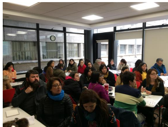
Photographs (above): Workshop and academy activities for science teachers with HHMI/Biointeractive and BNI professionals.

In the context of an Explora-Conicyt Project we developed Mentes Transformadoras , a science book for school students, teachers and the general public. 12 scientific research projects developed in our country were explained in simple language, with infographics and illustrations, including also some activities for the classroom. We delivered 1,000 units of this book to schools and general public during different scientific events.